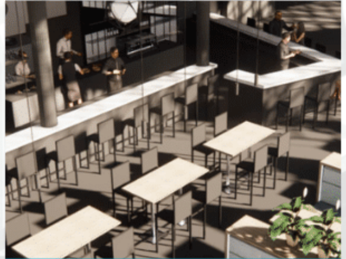
Location: HNOSS HARPA