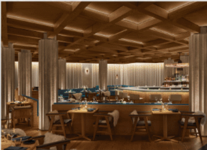
Location: TIDES RESTAURANT EDITION