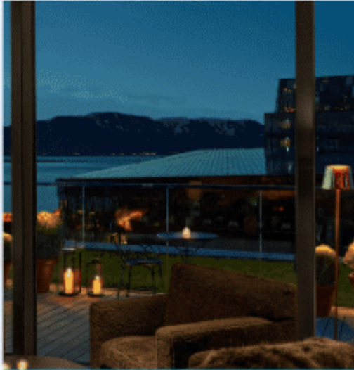
Location: THE ROOF EDITION