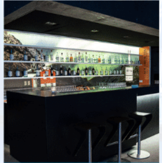
Location: TOP FLOOR HARPA