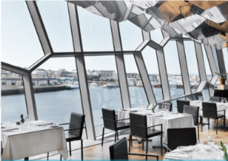
Location: LA PRIMAVERA HARPA