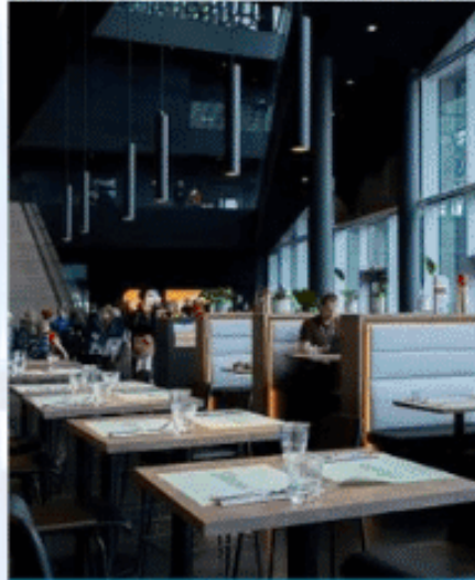
Location: HNOSS HARPA