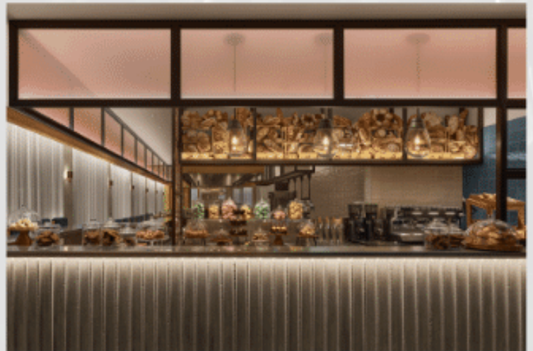
Location: TIDES CAFE EDITION

NETWORK OVER BREAKFAST, LUNCH AND DINNER