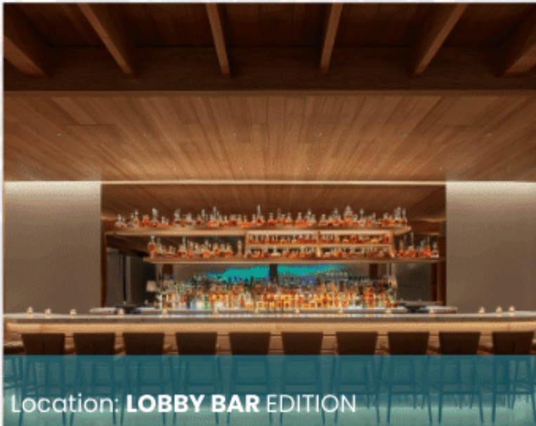
Location: LOBBY BAR EDITION