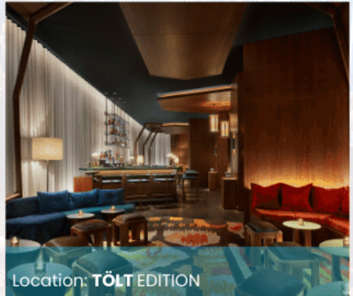
Location: TÖLT EDITION