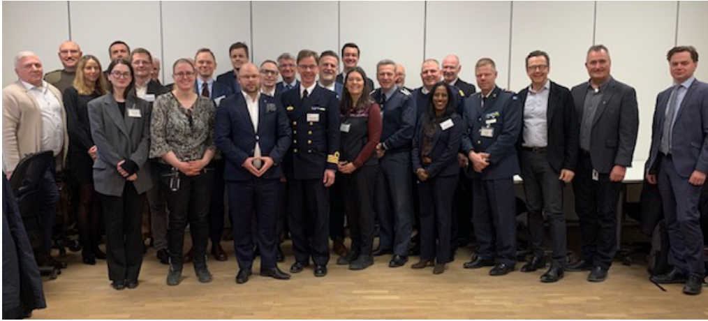
Highlights from the Swedish Defence University visit.